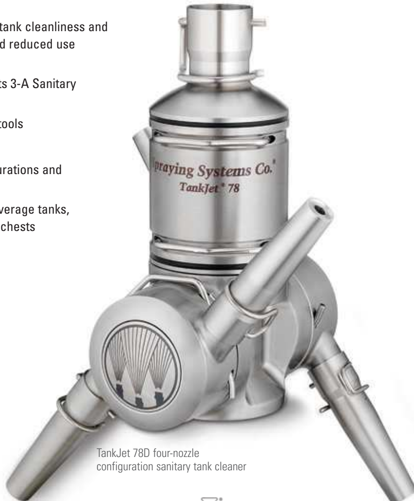
TankJet 78D four-nozzle configuration sanitary tank cleaner